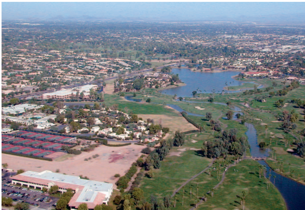
Figure 1. Photograph of the Central Arizona–Phoenix Long Term Ecological Research study area, showing Indian Bend Wash, a former intermittent stream channel that has been modified to include permanent lakes and a highly productive riparian zone, with surrounding suburban and light industrial land use.